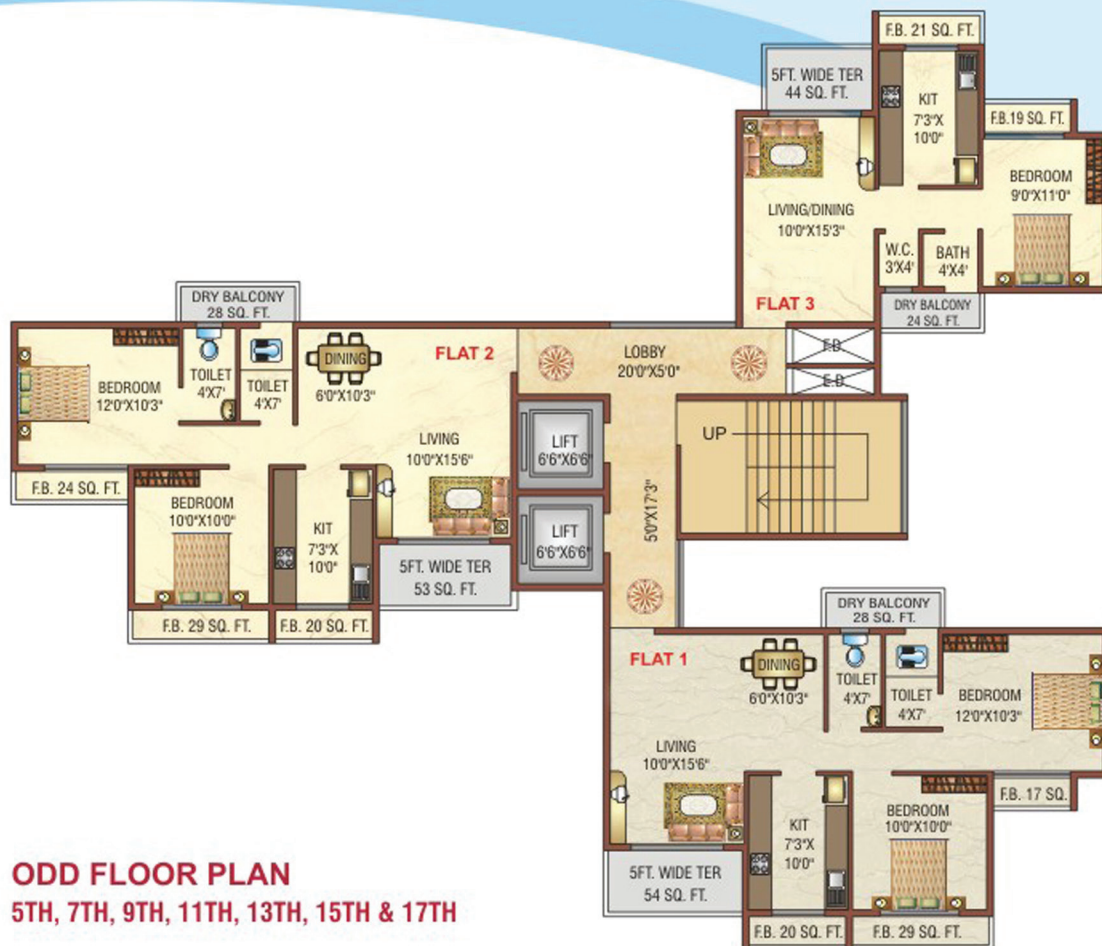
ODD FLOOR PLAN 5TH, 7TH, 9TH, 11TH, 13TH, 15TH & 17TH