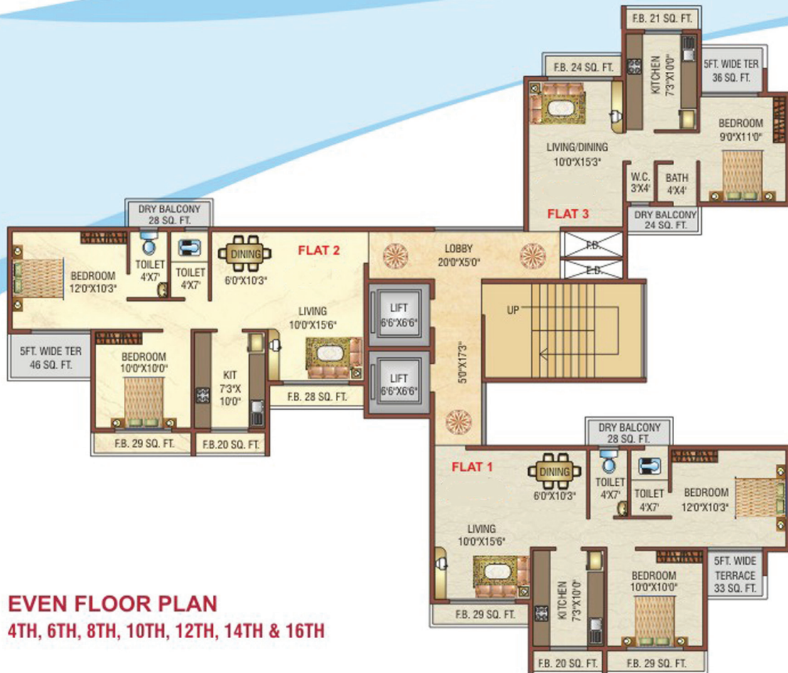
EVEN FLOOR PLAN 4TH, 6TH, 8TH, 10TH, 12TH, 14TH & 16TH